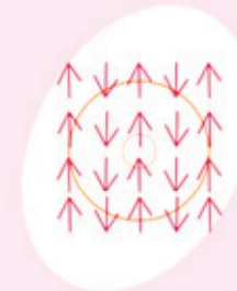
Up & Down Lines